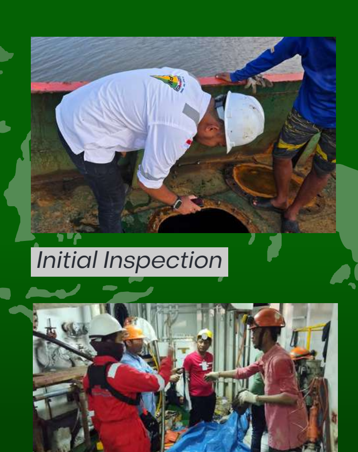
Preparation & Progress

PT. Poetri Intan Mandiri provides specialized tank cleaning services fuel. chemical. and water storage tanks, adhering to the highest industry and safety standards. The process begins with an initial inspection to assess the tank's condition and determine specific cleaning requirements. Once assessed, our team prepares the necessary tools, such as highpressure washers and eco-friendly cleaning agents, while ensuring all safety equipment is in place. During the cleaning process, we use advanced techniques like highpressure iets and mechanical scrubbing to thoroughly remove sludge, rust, and contaminants. Collected waste is then managed responsibly, following environmental regulations. After cleaning, a final inspection conducted to ensure the tank is spotless and ready for use, and a comprehensive report is provided to the client.